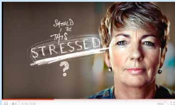
NHS MidLifeCheck's GP TV advert.

others about your learnings in running any NHS LifeCheck campaign, please email us or send photos to: lifecheck@dh.gsi.gov.uk