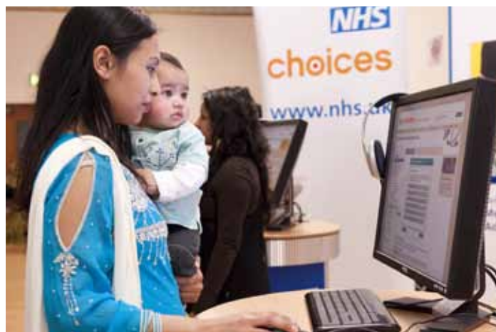
NHS Choices has eight million visits each month.

If you would like to find out more about NHS Choices and how you may be able to use it in your