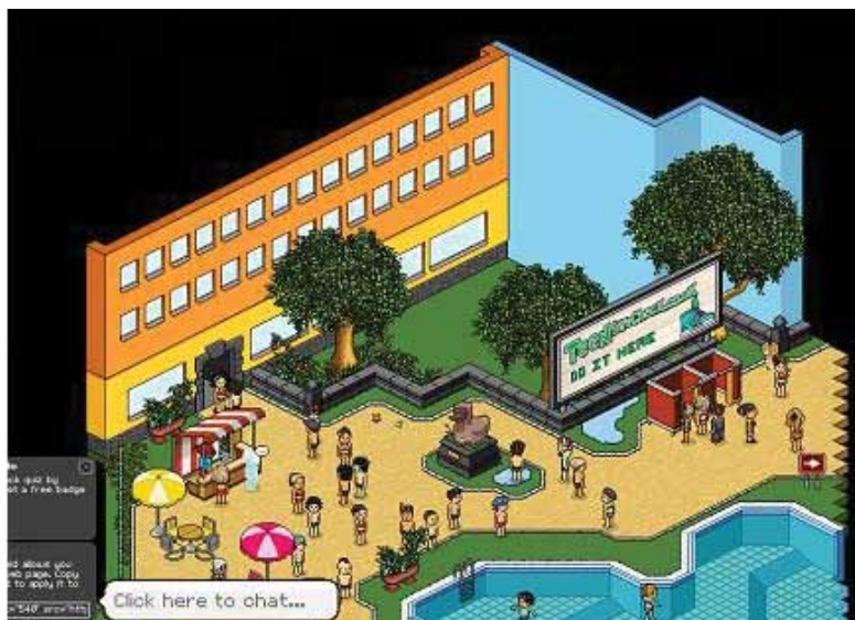
Thousands of Habbos visited the TLC sponsored Lido.