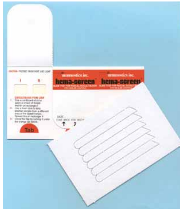
The FOB test

Before collecting each bowel motion it's a good idea to get everything ready. You'll need to have two of the cardboard sticks and the orange or red and white test card. Write the date on the first flap on the test card, then peel back the flap. Underneath you'll see two windows – one for each sample of your bowel motion.